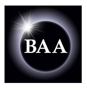
Founded in 1890